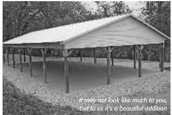
It may not look like much to you, but to us it's a beautiful addition

Because the concrete had not been poured on time, John had to realign many of the original forms that had drifted out of position. It was decided to improve the original concrete plan to reduce the chance of cracking. French drains were added to decrease water run off. In anticipation of the varied events planned for the pavilion, underground wiring was installed for electrical service access. The pavilion itself was wired to accommodate lighting and/or fans. John even braved the gravel-upon-mud "outback trail" to pour the floor. Although the budget doubled in cost, the McIntyres generously covered the