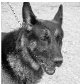
BSL targets many breeds including German shepherds

Proposed Pennsylvania House Bill 2553 will remove the state's prohibition on breed specific local (BSL) ordinances, thereby allowing any town, borough, city or other local government to adopt any type of dangerous dog ordinance it chooses. Up to now, PA